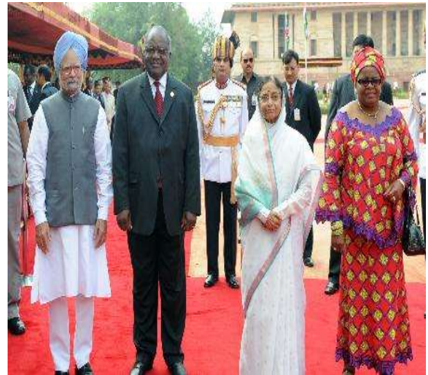
President of the Republic of Namibia Hifikepunye Pohamba (2nd L), accompanied by his wife Penehupifo Pohamba (R), poses for a group photograph with Indian Prime Minister Manmohan Singh (L) and Indian President Pratibha Singh Patil (2nd R) during a welcoming ceremony at the Presidential Palace in New Delhi.

The two sides have also inked four other pacts as part of a move to inject “fresh dynamism” in their ties. Both the countries are committed to the Non-Aligned Movement (NAM), and they want continuation of the reform process of the UN, particularly the