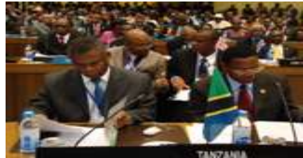
Heads of State and Government of the African Union (AU)