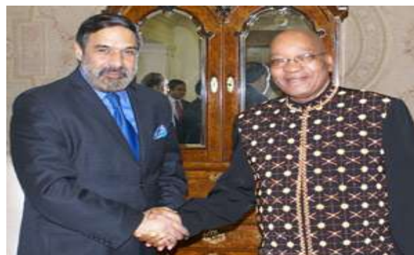
Indian minister of Commerce and Industry Anand Sharma and President of South Africa

Indian Minister of Commerce and Industry Anand Sharma visited South Africa on 20-24 August 2009 at the invitation of his counterpart, Minister of Trade and Industry, Dr. Rob Davies. Sharma met South African President Jacob Zuma during his address at the India Business Forum (an umbrella organization of Indian business representatives in South Africa) in Pretoria on 22 August 2009. During