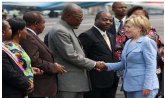
U.S. Secretary of State Hillary Clinton is greeted by members of the government on arrival at the airport in Kinshasa, Congo, Aug. 10, 2009. Clinton's Congo stop is the latest in an 11-day journey through Africa to promote development and good governance and underscore the Obama administration's commitment to the world's poorest continent.

Hillary Clinton visited Angola and praised the country for its progress since the end of a devastating civil war in 2002. She said that she has also been impressed with peaceful and credible parliamentary elections in 2008. Hillary signed a trade agreement that would pave the way for more US investment in this war-torn African country, particularly in job-producing areas such as agriculture.