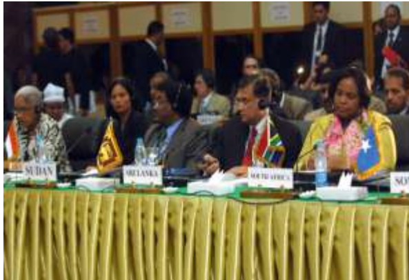
Foreign Minister's meeting on the sidelines of NAM

ongoing global financial crisis, climate change, the Middle East peace process, food security, energy and nuclear issues. The summit admitted Argentina as the NAM observer country and the World Peace Council as its observer organization.