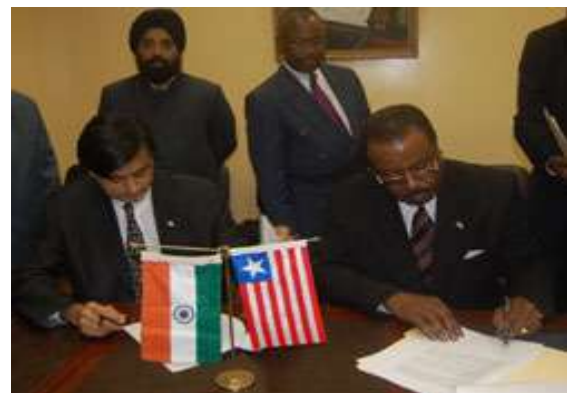
Acting Foreign Minister William V. S. Bull and Dr. Shashi Tharoor, Minister of State for External Affairs of India sign Joint Statement.

Indian Minister of State for External Affairs Shashi Tharoor went for a week-long visit to Liberia and Ghana in West Africa, his maiden ministerial visit to African continent, on 16-21 September 2009. Tharoor during his visit to Liberia, the first by an Indian minister in nearly four decades, interacted with top political leaders, including the charismatic President Ellen Johnson-Sirleaf, Africa's first elected woman head of state, and underlined "India's solidarity and friendship as it rebuilds itself".